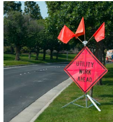
UTILITY CUT REPAIRS

PROVEN MOST DURABLE BY FEDERAL HIGHWAY TESTING*