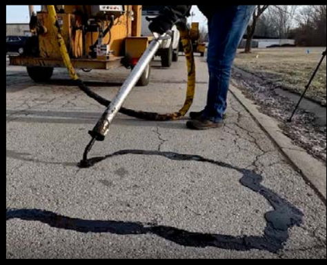
Hot Pour Crack Sealant