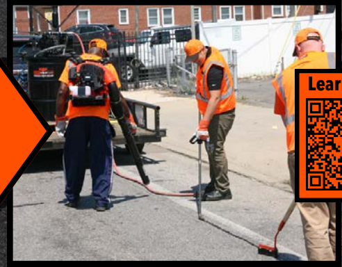
Cold Pour Crack Sealant