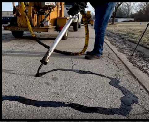
Hot Pour Crack Sealant