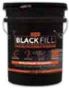
Black Fill® 5 gal Pail SKU: PP-BF-5

Black Fill® is a deep-penetrating, long-lasting asphalt repair for larger, deteriorated areas. Used with the pump for 55 gallon drum.