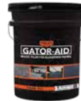
Gator-Aid® 5 gal Pail SKU: PP-CF-GATOR5

Cold mastic filler designed for repairing small to medium areas of severe alligator cracking.