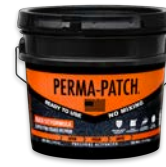
30 LB QUICK SET SUPER FINE PAIL PP-30-FP