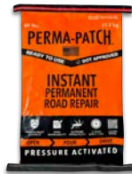
60 LB REGULAR MIX BAG PP-60-C