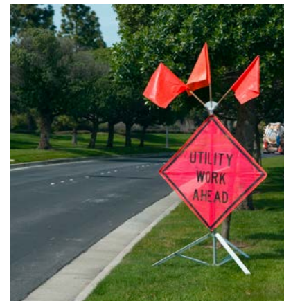
UTILITY CUT REPAIRS

PROVEN MOST DURABLE BY FEDERAL HIGHWAY TESTING*