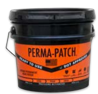
50 LB REGULAR MIX PAIL PP-50-CP