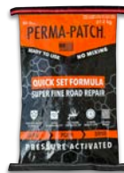
60 LB QUICK SET SUPER FINE BAG PP-60-F