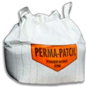
1 TON REGULAR MIX BULK BAG PP-2000-BC