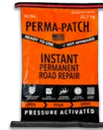
50 LB REGULAR MIX BAG PP-50-PLC