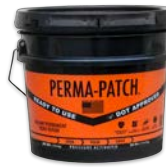
30 LB REGULAR MIX PAIL PP-30-CP