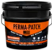
50 LB QUICK SET SUPER FINE PAIL PP-50-FP