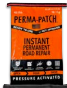
40 LB REGULAR MIX BAG PP-40-PLC