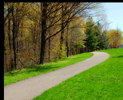
PARKS & RECREATION