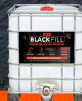
275 Gallon Tote