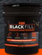
5 Gallon Pail